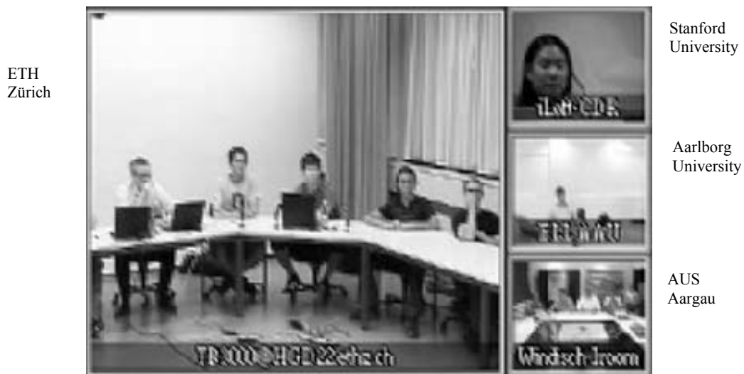
Figure 2. Multi-point video conferencing with four sites (the “speaking site” is automatically shown in the large window)