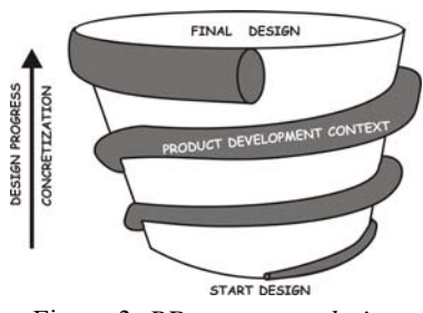
Figure 3. PD context evolution

Figure 3 gives a conceptual picture of the relation between product development process and PD context complexity. The development process starts on the bottom of the cone and proceeds with an increasing degree of concretization, through areas associated with market, design and production [1]. At the beginning of the development process, designers are uncertain about the details of design parameters and characteristics. All these uncertainties increase the numbers and combinations of possible outcomes. The outer spiral represents product development context. The spiral widens from bottom to top, indicating that the amount and complexity of information and knowledge is increasing as the design approaches completion.