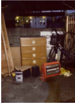
Figure 3. A dumping ground of bulky garbage

But, It is interesting to follow up this point further, but this is not our present concern, as stated above. The purpose of this paper is to present the study of “Re+design” workshops which target various participants. We should consider the study of “Re+design” workshops in all its aspects. What is especially important is one way for design education and life-long learning [5] in the future.