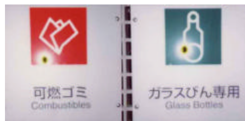
Figure 1. The sign and pictograms of garbage dump

In addition, there is a garbage or environment problem in the background. Recycling resources has been done. Collect a plastic or glass bottle, can, and recycle used paper products are notable example [Figure1].