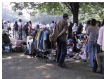
Figure 2. Flea market in Tokyo

Another example of Recycling is flea market [Figure 2], garage sale, bazaar, and auction, etc. There are a convenient way to recycle an unwanted item that else could use.