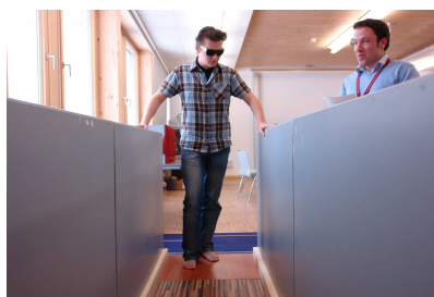
Figure 2. Test Design for the Foot Test

Floor C) Smooth laminate flooring without decor stamping