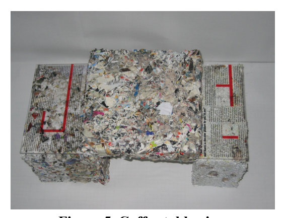
Figure 5. Coffee table view

The benefits associated with this potential shift from the conventional design process to one that embraces community engagement in many aspects, it may be possible to impart new values to interior spaces through our designs. As a result, designs will carry essential, and more lasting, value. Firstly as a result of the use of a making process which is not harmful to the environment; secondly, as a result of community involvement; and finally as consumers will be exposed to the displayed text about relevant issues. As a result, the object has the potential to transfer its environmental and sustainable values at different levels. (Figure 5)