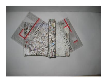
Figure 4. Coffee table plan view

It is an object for every day use, that its primary sources are paper blocks and glass – materials that are in continuous cycles. One of the main sustainable values and principles was to fulfill more than one purpose. That is, to function as a table, as well as to inform and transmit messages about global environmental issues. This is given through the text that is printed on the glass surface of the coffee table. Furthermore, the surface can also accommodate texts of various contents that are legible to the viewer. (Figure 4).