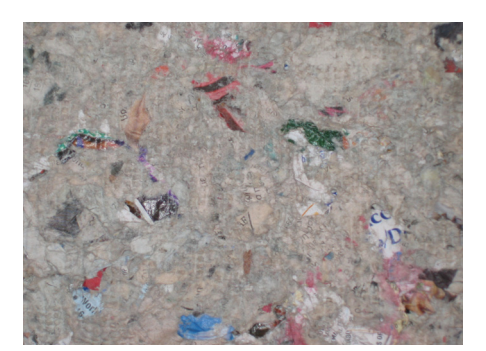
Figure 2. Paper mass

People were willing to recycle and do more about this issue, but the State was not at that moment ready to provide the option of recycling. Working this out in our mind we decided to use some of these papers. We created a series of paper blocks. They were magnificent. Warm to see and touch. The color was neutral. Some splits from the colorful pages of magazines were obvious. Also some vivid white pieces from white paper were clear. (Figure 2).