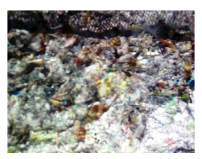
Figure 1. Paper waste

The production of a coffee table is our new design work, therefore based on this concept as well as the fact we do not vecycle paper in our area, we started to gather paper. (Figure 1)