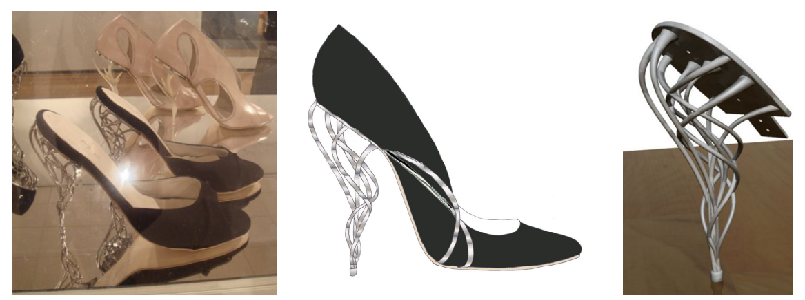
Figure 2. Rapid prototyping model of the heel, final shoe and sketch above

The outcome, see Figure 2, is that the first design prototypes have been successfully made into shoes and exhibited in the student degree show. As a result the shoes have been shortlisted for two design awards and the technology suppliers have an interesting case study which demonstrates the potential for this material process in new markets, and useful marketing prototypes which can be used for trade shows and promotional materials. The heel displayed in Figure 2 is not just a test piece for this the rapid prototyping technology, it is also a fashionable item, which keys in with current cat walk fashion for interesting shapes in heels. The shapes are organic and flowing. The design of these heels is interesting as an art object, just as much as an example of a new technology. During the design process observers reacted to the visual quality of this organic and praised the emerging design for its aesthetic qualities. In this sense the design was a success even before its structural qualities were tested. The playful nature of the design process and aesthetic considerations were the drivers without constraints of cost or mechanics. However, the actual cost which would be around $2000 is still acceptable in the couture market, so that the product is potentially viable, and alternative materials are also now being tested which would reduce costs and make larger volume production possible