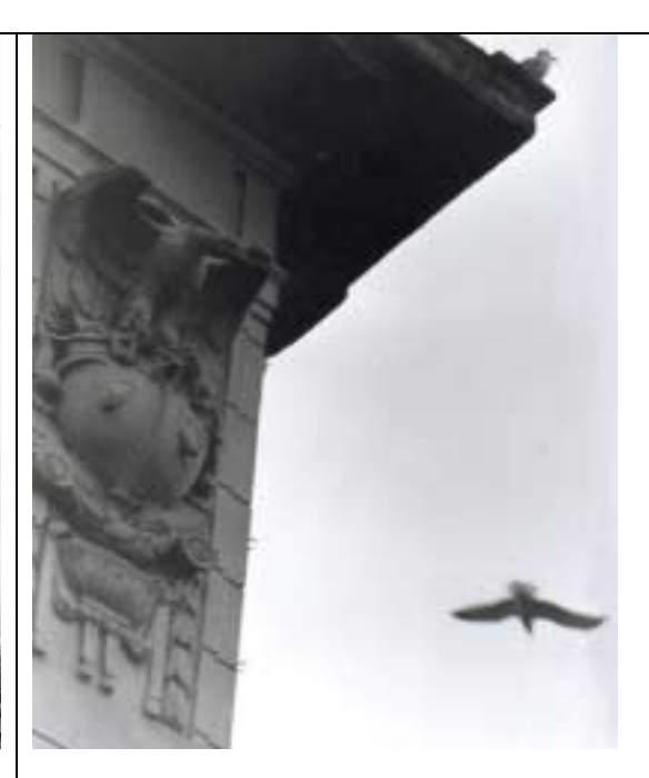
...I remember sea gulls when I think of Istanbul...