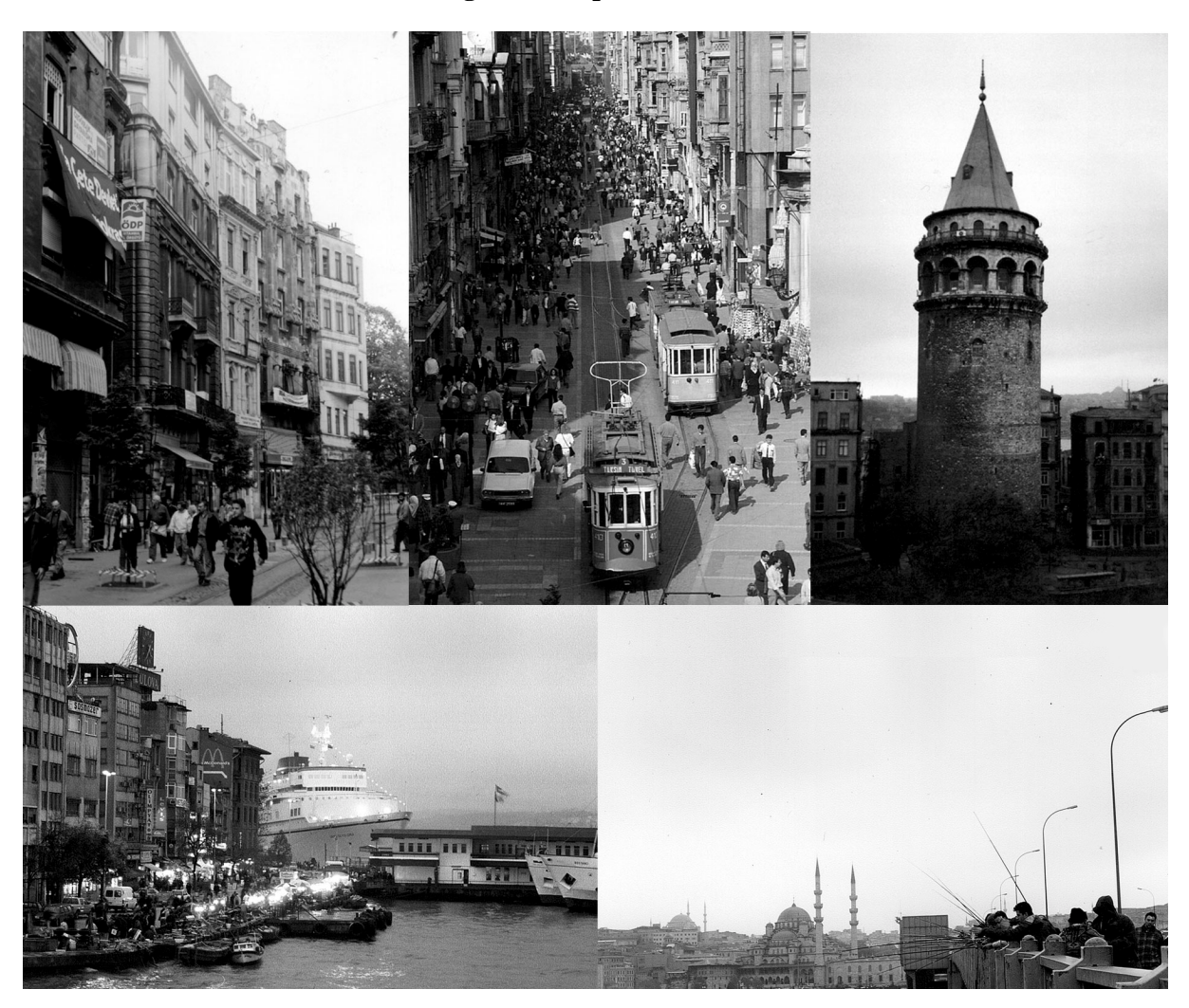
Figure 2. Scenes from today and the past