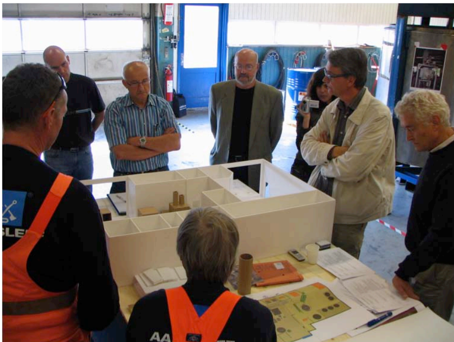
Figure 3. The use scenario playing out in the production hall

Use scenarios were applied in two versions. In the first, the work processes and the spatial workplace were simulated with the help of a 1:20 scale model of the new facility, with moveable machine models and LEGO figures. We also used a kind of mock-up based on floor markings in the actual production hall where new machines were to be installed (Fig. 3).