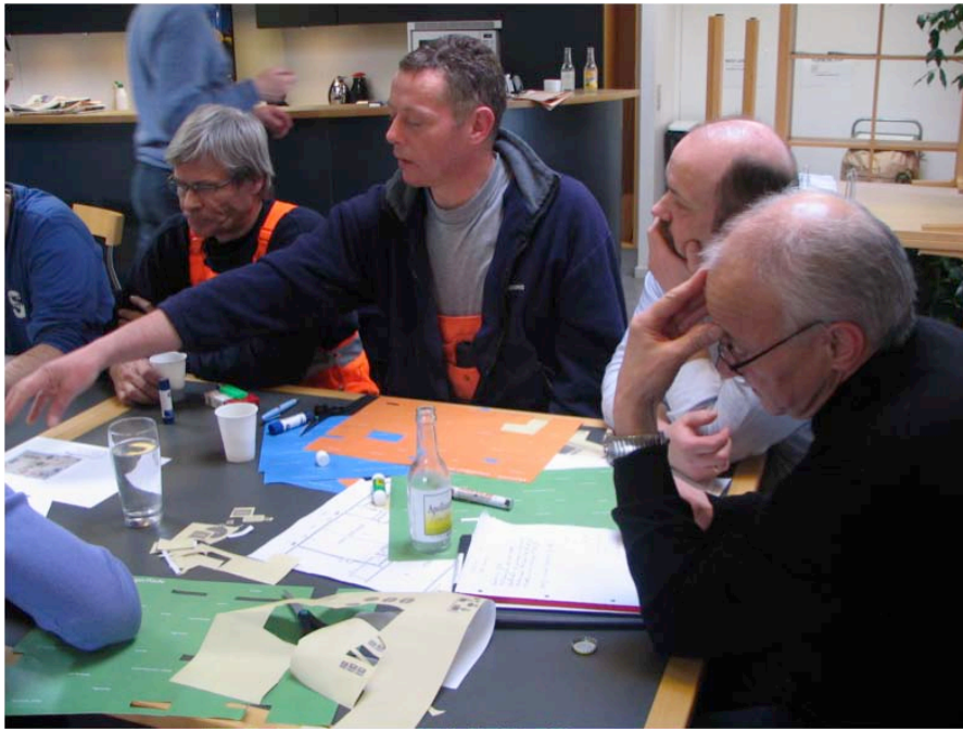
Figure 2. The layout design game

the idea (Fig. 2). The game explores different layout possibilities through “what if ...” experiments at the game board, and the impact of each on ergonomics and production issues.