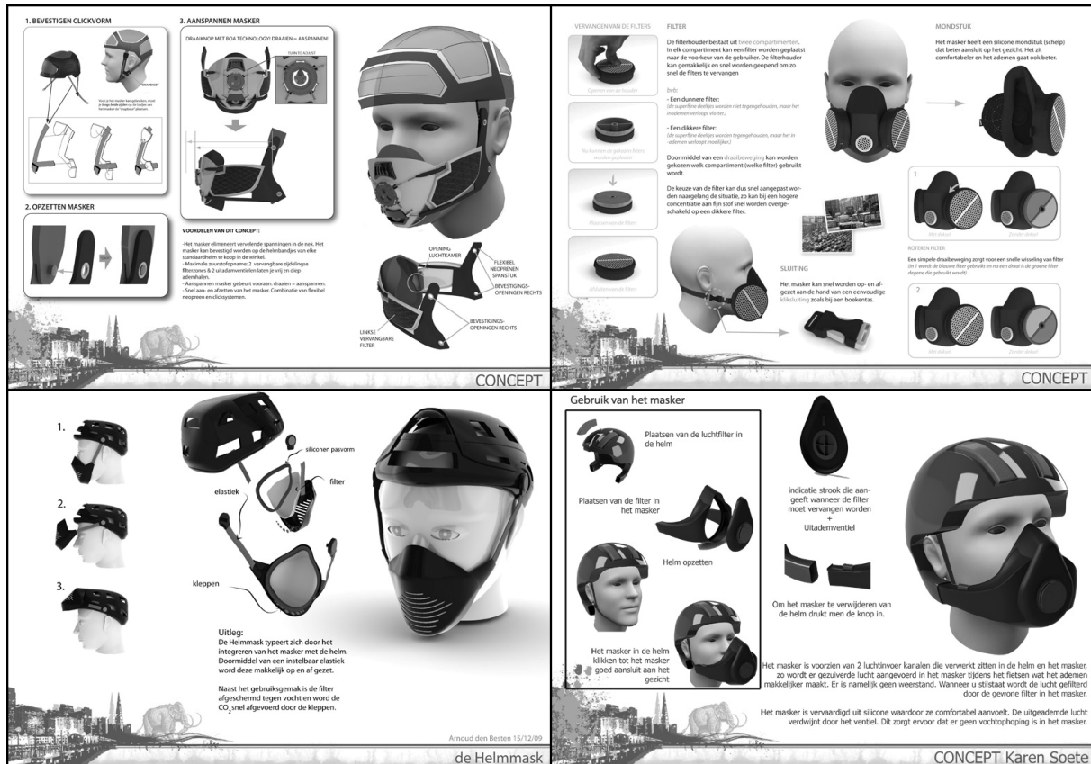
Figure 4. Example of four concept cards designed by students of the same team (Arnoud Den Besten, Karen Soete, Lucas Standaert, Orlando Thuysbaert)

Fifteen groups of 4 students were composed, each designing a mask for one of the four target groups. In order to be able to distinguish the consumer product preferences, it was important to control the unsought variance in the research concepts as much as possible. Therefore, the students started from a standardized storyboard concept card per group and added their own product concept and features on this standard A3 formatted card. Using these concept cards forced students to present their ideas in a simple overview, emphasizing the main topics and aspects of their designs.