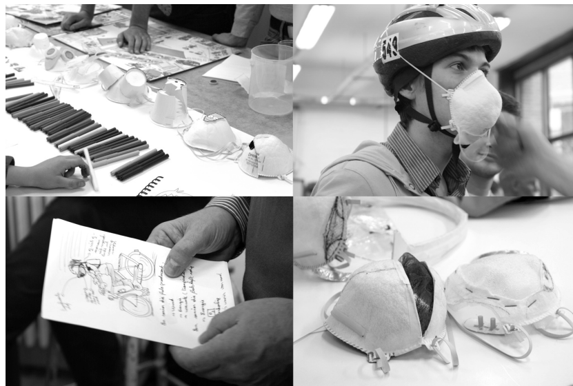
Figure 3. Compilation of images of the preliminary prototypes, sketches and the co-creation session

Based on the remarks and suggestions of the potential users, design students and potential users thus co-created advanced versions of their favourite dust masks and new product concepts. During the workshops facilitators observed, what Kingsley (2009) calls: "increased empathy between the participants, a move away from the self towards external and community concerns." [7].