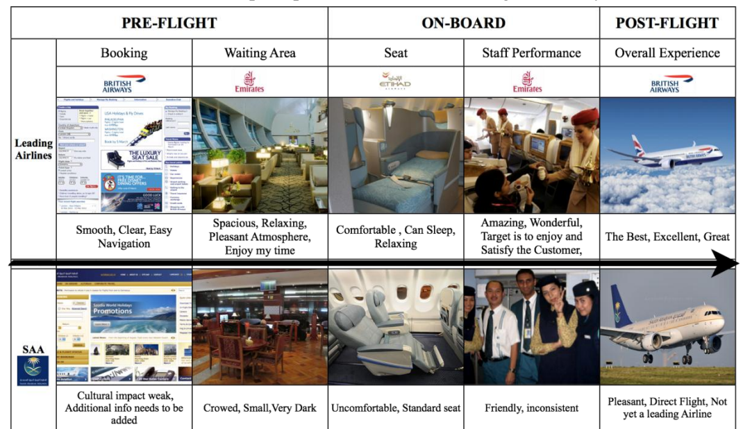
Table 5. The perception of the value of design creativity

The visual analysis (table 5) demonstrates the perception of the value of design creativity for leading airlines and SAA addressing different products and services in a customer journey. The images in the top row illustrated leading airlines comparing it with SAA in the bottom row. Participants expressed their views in term of design creativity describing their experience, which justify the gap between leading airlines and SAA in relation to the different perception of design creativity. Furthermore their chose of airlines depends a great deal on the products and services offer by the airline.