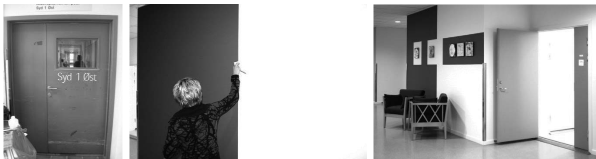
Figure 2 (left). The entrance to the old psychiatric department called the “prison door”. Figure 3. (middle) staff in environment group reserving a place for the visual intervention. Figure 4 (right). Painted wall framing the art outside a patient room.

application was sent. The project was approved by the Regional Committees for Medical Research Ethics (REK 2008:2333) at the University of Oslo. The study was approved by the Norwegian Social Science Data Services (NSD) at the University of Bergen once it was ensured that the data collection followed the Helsinki declaration [14]. When the project was approved it became a part of the documentation about Health Promoting Hospitals - a network which is a part of World Health Organisation with the aim to promote public health.