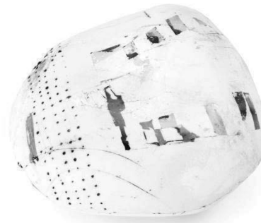
Figure 5. "Partly vanished", ceramic forms in marble sand made for light therapy room. Figure 6. "Arctic border" a public art form made in collaboration with nurses to stimulate communication at the ward

In the session the physiotherapist asked the patients to choose one favourite stone each and elaborate about their choice. Hardly any of the patients were able to do verbalize the reason for the choice. A nurse reflection on the situation was that even though the communication was nonverbal by many, they were still communicating through the way the stone was held, and how the patient interacted with the object. It told her something about the patient. One of the patients showed how the flat stone could be used to be thrown on the water surface. Others were only feeling the changes in the form with a finger. Both the physiotherapist and nurse explained thoroughly how important the dialogue with the body was. It created a more intimate communication and another quality in the contact experience. Communication that was nonverbal was observed through materiality and touch as means. The patient's actions were evaluated and explained by health professionals. A nurse professor commented that the experience to be cold on your hands, to be warm on your hands, and to become one with the stone, that was a totally other dimension than to look at an image on the wall.