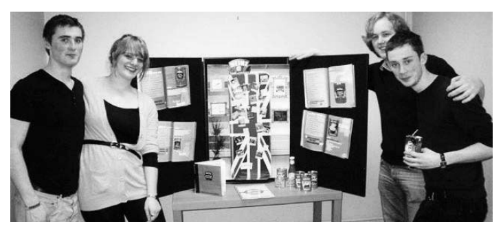
Figure 1. Students presenting on the Skills Challenge

The multiple presentation format works well with students given the opportunity to practice their delivery several times. This format can be resource heavy on numbers of staff. In order to reduce the number of judges required the format can be changed with the teams presenting only once to one panel using, for example, PowerPoint. This also reduces print costs for students.