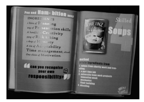
Figure 2 Employability soups "Team-ato" and "Pea & Hambition Soup"

Figure 1 shows the display panel created by one team students and figure 2 shows how this team decided to use their creative skills to present their qualities in the form of ingredients for new soup varieties, "Team-ato" and "Pea & Hambition Soup". Other teams have used role play in the style of "The Apprentice", used toys as metaphors for teamwork or made fresh sandwiches to represent their different skill sets.