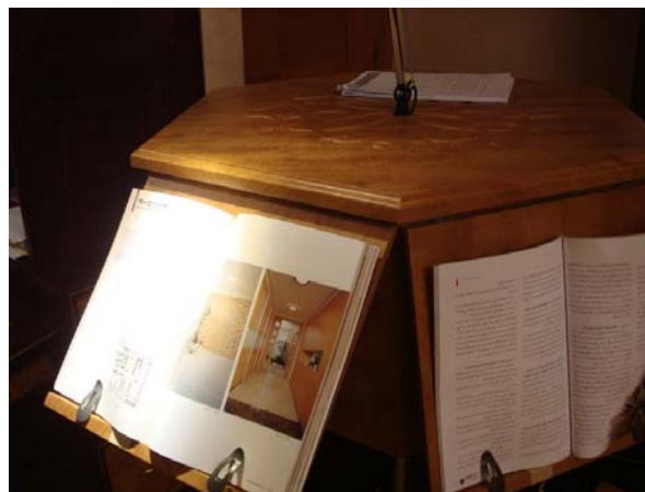
Figure 4. Multiple Books in open position.