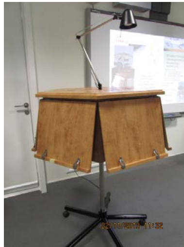
Figure 3. General Overview of Product HEXIII

HEX III is a wooden hexagonal tool consisting of six adjustable angle-reading panes that can be retracted in place enabling convenient reading angle. Each of the six reading panes is equipped with page holder that kept the book open while switching to another one. The reading panes are attached to a hexagonal upper body at the centre through hinges and can rotate freely through the entire 360° allowing quick and easy access to any book with ease. The overall reading body height is adjustable providing the reader with a unique ability to read while sitting or standing. Five mobile caster wheels that provide easy mobilization of the tool support the upper body. The caster wheels are lockable type that provides the tool with stable positioning. The tool was provided with independent freely rotating LED spotlight at the top providing the reader with better vision whenever required. Moreover, the top surface can provide significant area for the reader to take notes or write comments. The tool is intended to have a coffee cup holder in the next phase. It also will provide deck for charging mobile phone, listening to music, viewing i-Pads, and some other interesting features providing reader with most comfortable means. Figures 3 and 4 show the product.