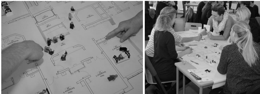
Figure 2. Left: The blueprints and LEGO figures, right: A blueprint simulation

The nurse in charge of developing work practices had beforehand created five scenarios. The scenarios were everyday situations, which likely would happen in the new ICU work system. The simulation started by one of the participants reading aloud a scenario. This led to the participants placing LEGO figures on the blueprint to depict the healthcare workers and patients as described in the scenario. The scenarios included a series of questions on how to handle the everyday situation in the new work system. These questions were the foundation of exploring different ways of designing and organizing the work practices. The exploration was first based on the participants moving the LEGO figures on the blueprint in accordance with the scenarios. This led to discussions of possible solutions on the scenarios, which led to new scenarios acting with the LEGO figures. After each scenario, the facilitators asked the participants to reflect and write down suggestions for the future work system.