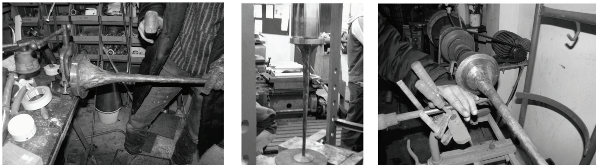
Figure 4. Prototype production.

Also, designers must be aware of the production systems potential and their relationship between human well-being and the planet's sustainability. In this sense, this project was divided in five patterns (Alexander, 1977): Pattern 1 - analysis of the productive scope with the musical instrument builder; Pattern 2 - choosing the trumpet's component; Pattern 3 - choosing project partners; Pattern 4 - creating satisfactory hypotheses (Cross, 2006), and Pattern 5 - quality test carried out by musicians to collect their judgment. This article will present the results of Pattern 5, namely quality testing by the trumpeters.