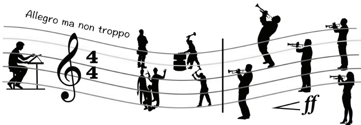
Figure 3. Design and music dialogue through creativity and co-design. Diagram by the authors

Designers have the responsibility to articulate such processes, designing methods and practices to allow effective interaction between all actors. It is important that social, cultural, and economic actors present their different points of view and interact in complex dialogues. This allows incorporating the genius loci onto material culture and design; capturing in time the prevailing character and atmosphere of a specific place. There are several innovation projects beginning with territory analysis, using existing productive resources and creating systemic products. Changes in demand were determinant for production structures that were more process-oriented and less product-oriented.