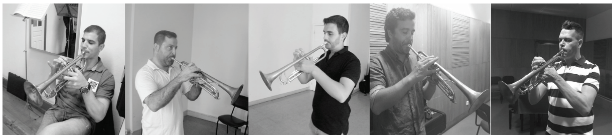
Figure 5. Players testing the trumpet.

Considering the trumpet base is poor, the musicians found the musical result surprising. The tests by the trumpeters were divided in two moments. A first stage when each one handled and played the trumpet freely, experimenting according to their individual background; and a second stage when they were asked to play the first moment of the Concerto for Trumpet in E flat major, by Franz Joseph Haydn (1796). This piece was expressly written for Anton Weidinger (trumpet virtuoso and trumpet designer), who created the first a 5-keyed trumpet allowing a full chromatic scale. The piece is intended to explore the harmonic sounds and ease of use the instrument can offer the player. It should be noted that this piece was well-known by all 5 trumpeters. The process also allowed questioning the geometry and shape of the bell, and the materials to use in the final model. Each trumpeter shared his own point of view, although they shared some views, such as the interest in trying the final product.