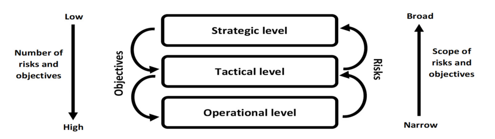
Figure 3. Schematic view, based on interviewee answers, of how objectives and risks flow to connect organizational levels