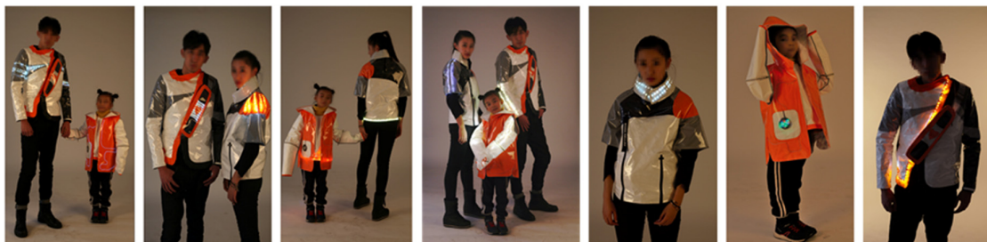
Figure 3. Interactive effects of prototypes a-g (from left to right)

Children's clothing, the reaction is through the Kcirs infrared sensor to the reaction of the hat, causing the front pocket decorative LED activated, to achieve the expected interactive effect ⑦ (Figure 3f).