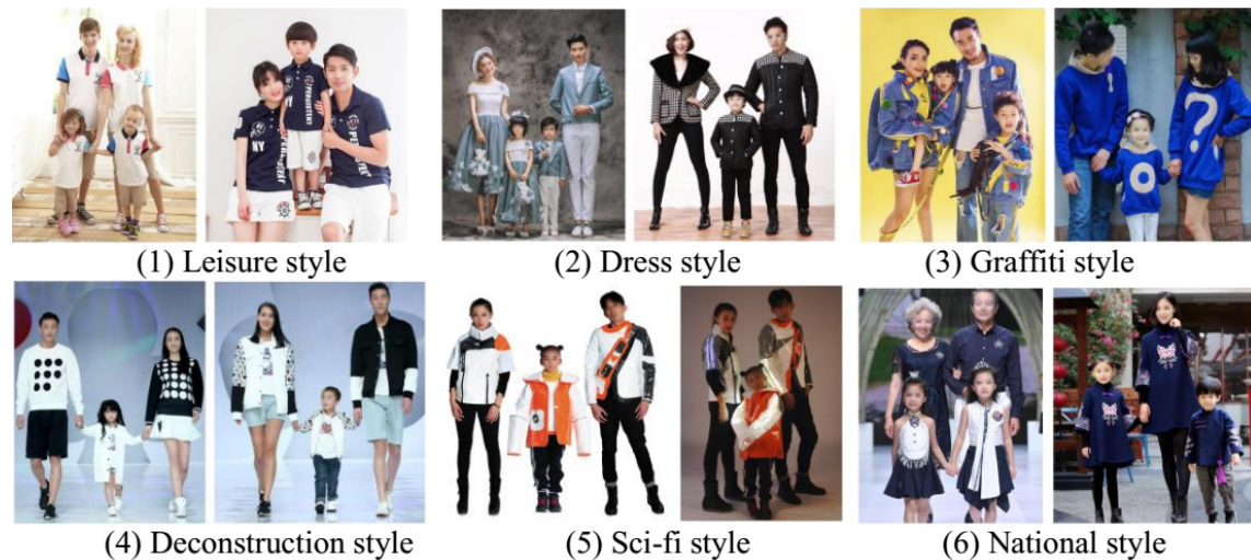
Figure 4. Photos of comparative categories

Evaluation elements include Leisure style, Dress style, Graffiti style, Deconstruction style, National style and our prototype i.e. Optical sensing sci-fi style (Figure 4). These six categories could cover and represent the existing types of parent-child clothing on the market.