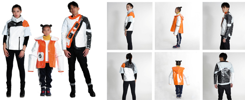
Figure 2. Photos of prototypes