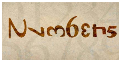
Figure 5. Chachi Hernandez, ‘Numbers’ http://www.chachihernandez.com/misc.html

In this approach, the shape resemblance of numbers to the letters are used rather than referring to a phonetic sound. Numbers are directly used instead of letters to form the word or phrase. The resemblance of some numbers to specific letters can be so obvious that, in addition to create attention, use of less space in composition and to infer two meanings simultaneously, designers may prefer to use them instead of letters to provoke feelings and/or information in the minds of viewers. For instance, number ‘4’ can be used instead of letter ‘A’, number ‘8’ can be used as letter ‘B’ or lowercase ‘g’, 7 can be used as letter ‘T’, 5 can be used as letter ‘S’ and 1 can be used as letter ‘I’ according to their shape resembles to the letters. Examples can be multiplied and varied according to the rotation of numbers. Such as the artwork, which is designed by Chachi Hernandez is a good example of showing the resemblance of numbers to letters (Figure 5) The word ‘Numbers’ is created solely using numbers instead of letters. Legibility is compromised as the proportions of the numbers are different than the letters. However, the word ‘Numbers’ is still apprehensible.