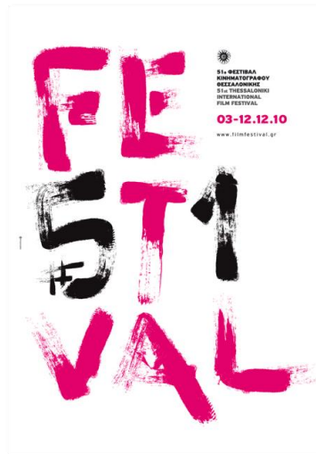
Figure 7. Dolphins Communication Design, '51 st Thessaloniki International Film Festival Poster' http://www.filmfestival.gr/inst/Festival/gallery/PressReleases/2010/51_TIFF/2010_11_09_51_tiff_poster.jpg

Making double impact on viewer is an effective way of communication in the means of expressing two concepts at the same time by using single image. For example, letters 'S' and 'I' are substituted by numbers '5' and '1' in order to express the festival's 51 st anniversary on the poster design for the '51 st Thessaloniki International Film Festival' which is designed by 'Dolphins Communication Design'. The calligraphic style of letters also kept in numbers in order the word 'FESTIVAL' to be perceived as a unified whole. Addition to that, number '51' is emphasized by using a different color (Figure 7).