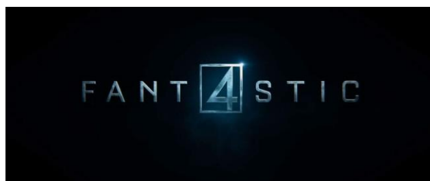
Figure 10. Anonymous, ‘FANT4STIC movie title’

As we mentioned before, the resemblance of numbers to letters are important for legibility. in the title of ‘FANTASTIC 4’ movie, the word is stylized as FANT4STIC by replacing number ‘4’ to letter ‘A’ not just because of the shape resemblance but because of its central position. The word ‘FANT4STIC’ is still legible because the eye perceives the number ‘4’ and completes the rest of the phrase (Figure 10). The FANT4STIC title is often credited as the beginning of a new renaissance in title design because it shows us that a title of a movie can do more than just the name of a movie. Number ‘4’ delivers the message of the series and the depicted letter ‘A’ itself.