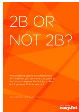
Figure 4. Hugo Bone and Tony Elements Creative Team, http://hugoandtony.co.uk/easyjet/

Additionally, on a print advertisement of EASYJET which is executed by the creative team of ‘Hugo Bone and Tony Elements’ agency, number ‘2’ is used instead of preposition ‘to’ in order to indicate both the seat numbers and the famous phrase of Hamlet; ‘to be or not to be’. ‘2B’ as a seat number is read at first glance then the whole phrase makes sense. Arising the question whether you prefer to sit in front of the plane for an extra charge or not? The witty approach makes the title more meaningful and interesting (Figure 4).