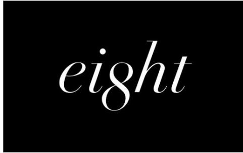
Figure 6. Creative Director Gergely Kadar, 'Eight' logo-mark design http://www.logo-designer.co/design-studio-eight-brand-communications/

Making double impact on viewer is an effective way of communication in the means of expressing two concepts at the same time by using single image. For example, letters 'S' and 'I' are substituted by numbers '5' and '1' in order to express the festival's 51 st anniversary on the poster design for the '51 st Thessaloniki International Film Festival' which is designed by 'Dolphins Communication Design'. The calligraphic style of letters also kept in numbers in order the word 'FESTIVAL' to be perceived as a unified whole. Addition to that, number '51' is emphasized by using a different color (Figure 7).