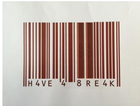
Figure 9. J. Walter Thompson advertising agency, http://www.tomstockton.us/jokes/picture_pages/pictures_file_050.htm HAVE A BREAK

When we look at the advertisement design of Kit Kat: we see that the letters ‘A’ are replaced by number ‘4’ and the letter ‘B’ is replaced by number ‘8’ on the brand’s tagline aiming to engage a sense of fun on both the brand and the consumers. J. Walter Thompson advertising agency of London, created this advertisement for Kit Kat that subverts a universal symbol of buying, the barcode. Two fingers of Kit Kat are part of the barcode along with the brand’s tagline, ‘Have a break’ (Figure 9). Again legibility is compromised a little but the message is delivered in a more interesting way. This compromise worth it if the attention is drawn to the message.