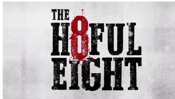
Figure 2. http://www.blackfilm.com/read/wp-content/uploads/2015/08/The-Hateful-Eight-logo.jpg

In this approach, numbers used as phonetic sounds with letters to verbally sound out a word. Using numbers as letters according to their phonetic sound, is to use them to represent the desired sound of a word, syllable or phoneme. The term phonogram refers to a character or symbol used to represent a word, syllable or phoneme 'Clair, Snyder, (2005)'. Moreover, it is very widely used and popular amongst graphic designers who want to; create attention, use less space in composition and express two meanings at the same time. For example, The Weinstein Co. which is an American independent film studio has released posters for Academy Award winning writer/director Quentin Tarantino's latest film 'The Hateful Eight'. In the logo on one of the posters, designer used the number '8' instead of letters 'ate' in the word 'hate', thus created a graphic image both indicating number '8' and the sound of it. At first sight number '8' stands out and then, eye makes connection between the number '8' and the word 'eight' later the word 'hateful' is read. It is neither perfectly legible nor illegible. Just in between. The typeface of the logo deliberately selected as a slab-serif in order to reflect the western style and number '8' is perfectly blended in the logo in order to create unity (Figure 2).