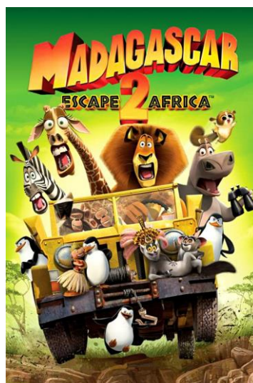
Figure 3. Anonymous, https://s-media-cache-ak0.pinimg.com/564x/e6/32/af/e632afeaebd87b13c326b257a691f60.jpg

Furthermore, another animation movie poster can be a good example of using phonetic sound of a number instead of a syllable (Figure 3). In this poster design, the number '2' is used instead of preposition 'to'. So the designer both indicates that the movie is the second of the series and the preposition 'to' between the letters 'escape' and 'Africa'. What he/she achieved by doing this is more space in the composition and created an attention on the movie title.