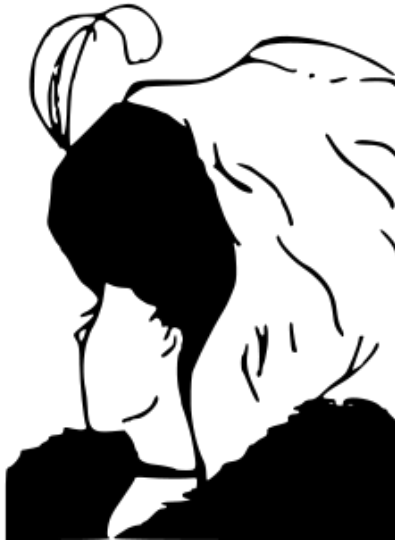
Figure 1. A Young Lady – Or – An Old Woman?

While several modelling processes are commonly employed, we will primarily focus on functional modelling in this paper.