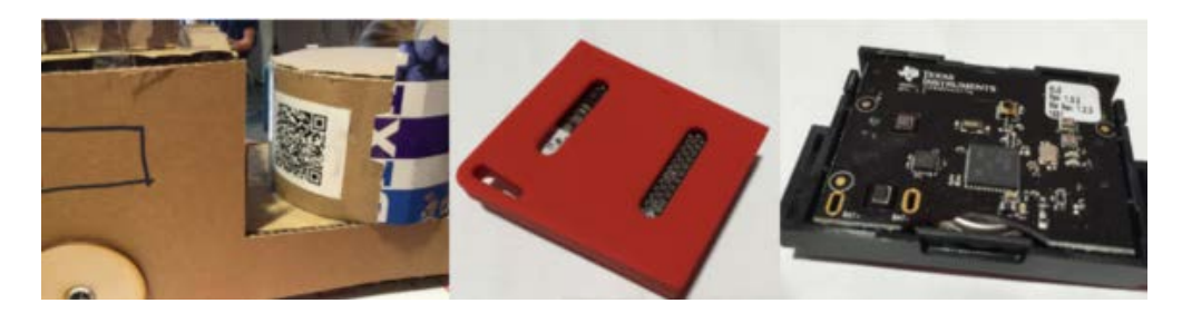
Figure 3: QR code, sensor tags and mechatronics

The creative workshop is set up in an IoT digital context. This includes soldering electronics and mechatronics, but also QR tags and blue tooth sensor tags for real time temperature and humidity tracking connectable to smartphones and pc's. These tags may be used to simulate IoT possibilities in prototyping as shown in figure 3. In addition to these possibilities, companies' expectations to IoT prototyping were reported to be 3D modelling (digital twin) and 3D printing. There are however practical limitations in digitalizing the rapid prototyping method due to time constraints. A real 3D model on prototype level requires minimum 1-5 days of computer work, whereas a VR model requires even more time to build. Unrealistic expectations regarding what is possible to achieve in ½-1 day may explain this result. In-house tools for simple 3D scanning may improve the user experience and better match companies' expectations to prototyping in a digital context.