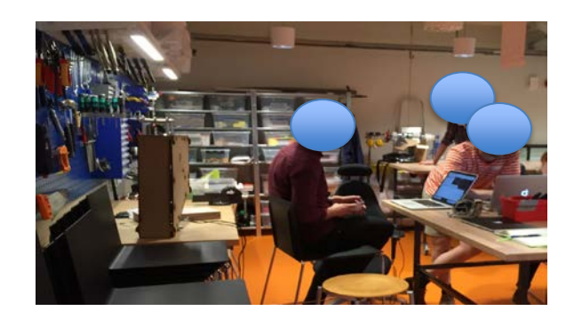
Figure 2: The creative space

The creative workshops have succeeded in increasing the companies' general competence and understanding of the design thinking method. As one of the interviewees reported: "we need to get comfortable in being outside our comfort zone". Especially the idea generating phase was reported as a take away, and something the companies later have implemented in their own organizations.