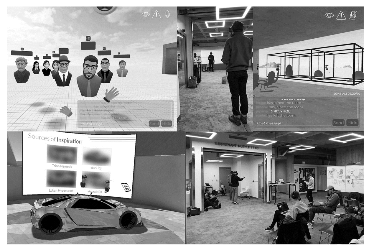
Figure 2. Spring 2020: (Clockwise from top left) Student early in class meeting in virtual reality (Rumii), 3 students in VR, multiple projects in VR, student-designed VR-modelled car being discussed in VR (Glue), students in classroom rotating through available VR devices with some in VR desktop mode.

Workflow today included actual and virtual white board ideation, individual and collaborative actual or virtual 2D/3D sketching, modelling and multi-dimensional bespoke artefact.